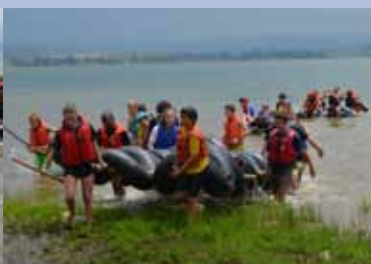
Close finish after a hard fought race.